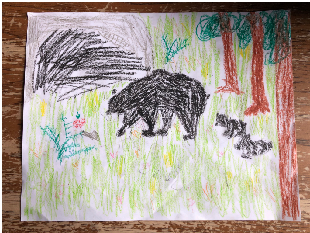
By Joy White