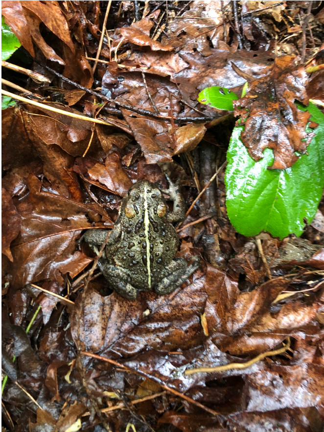
Migrating toad in the Cowichan Valley.